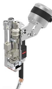
4 KW/6 KW Ultrakompact