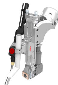
10 KW Fillet Welding Head