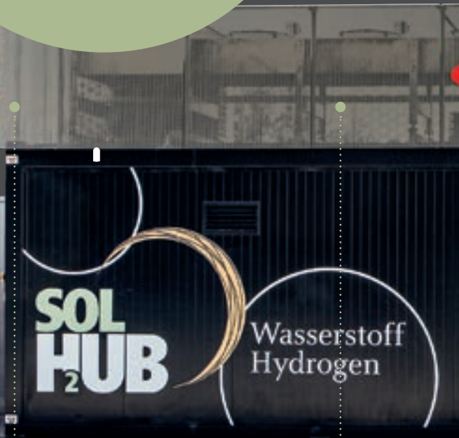
H 2 STORAGE SYSTEM